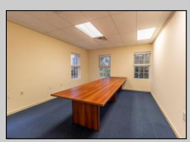
337 Jimmie Leeds Galloway Township, NJ 08205