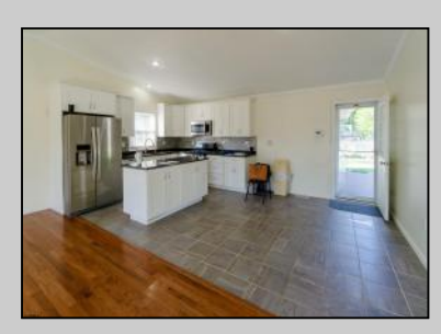
1112 Buck Millville, NJ 08332