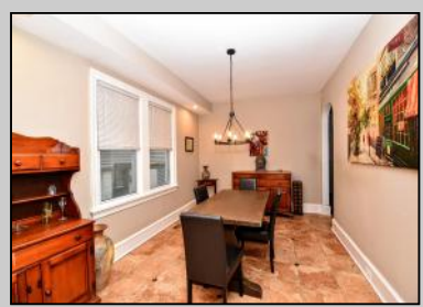
20 Baton Rouge Ventnor, NJ 08406