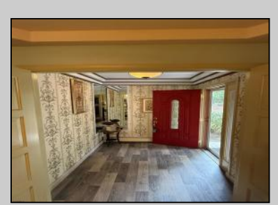
626 Columbia Rd Egg Harbor City, NJ 08215