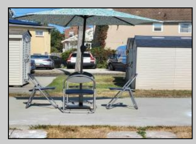
673 DOVER Atlantic City, NJ 08401