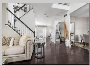
234 Jimmie Leeds Galloway Township, NJ 08205