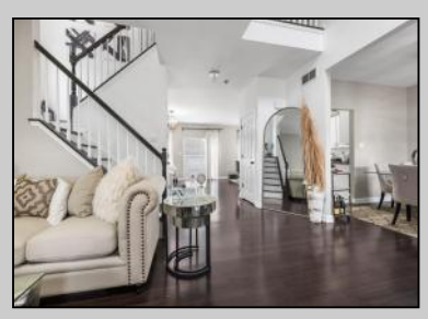
234 Jimmie Leeds Galloway Township, NJ 08205