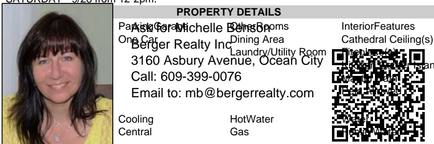
Sewer Public Sewer