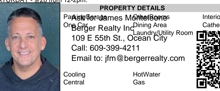
InteriorFeatures Cathedral Ceiling(s)