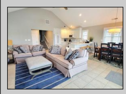
3026 Asbury Ocean City, NJ 08226