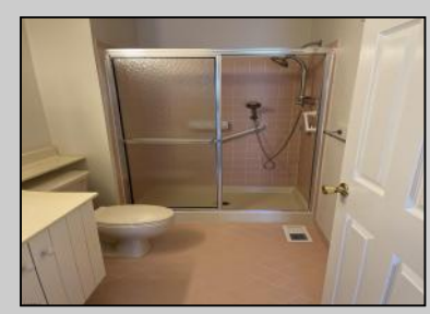
550 Central Ave Linwood, NJ 08221