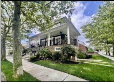
26 Richards Ventnor, NJ 08406