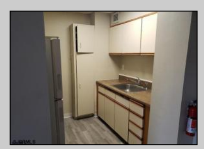
2834 Atlantic Ave Atlantic City, NJ 08203