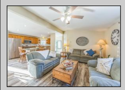
297 Pebble Beach Dr Mays Landing, NJ 08330