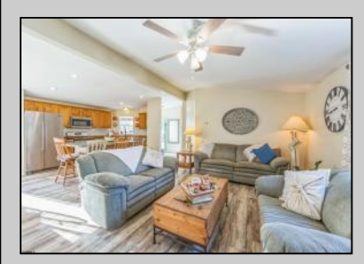
297 Pebble Beach Dr Mays Landing, NJ 08330