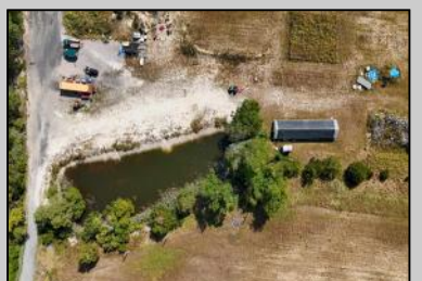
798 INDIAN CABIN Galloway Township, NJ 08205