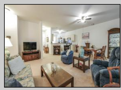
117 Newcastle Galloway Township, NJ 08205