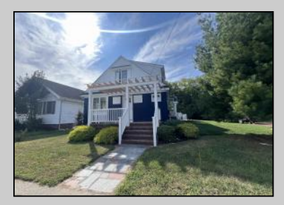
901 Oak Ave Linwood, NJ 08221