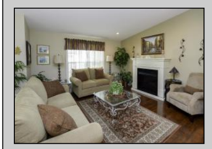
5 Sycamore Ln Mays Landing, NJ 08330