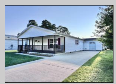
103 Baltusrol Mays Landing, NJ 08330