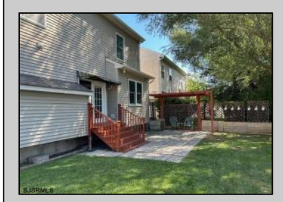
70 Cranberry Dr Mays Landing, NJ 08330