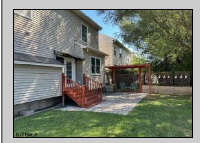
70 Cranberry Dr Mays Landing, NJ 08330