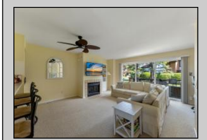
5 Spinnaker Ct. Ocean City, NJ 08226