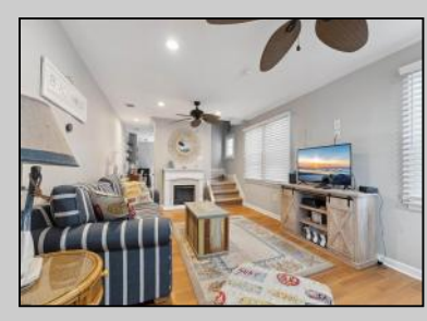
1107 West Avenue Ocean City, NJ 08226