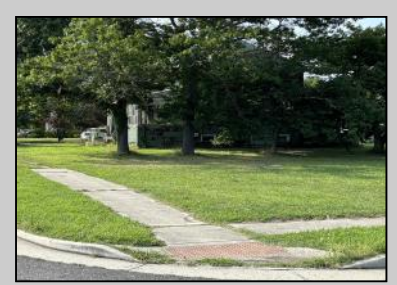
407 Egg Harbor Rd Hammonton, NJ 08037