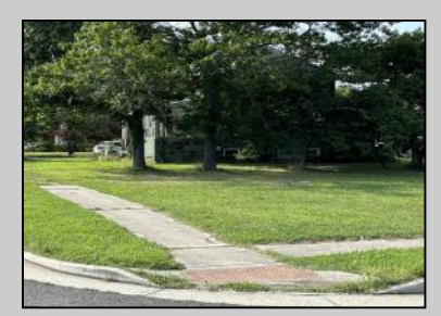
407 Egg Harbor Rd Hammonton, NJ 08037