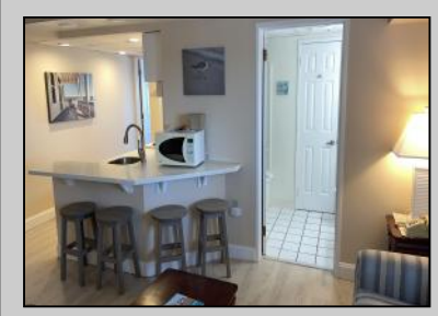
820 Ocean Ocean City, NJ 08226