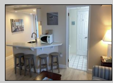
820 Ocean Ocean City, NJ 08226