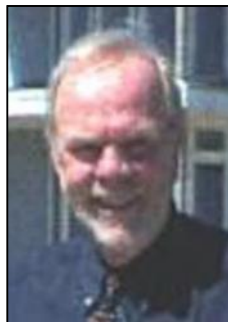
Walk in Closet