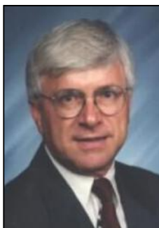
Walk in Closet