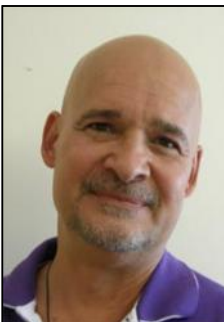
Walk in Closet