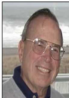
walk in closet

Call for Leon Grisbaum Berger Realty Inc 3160 Asbury Avenue, Ocean City Call 609-399-0076