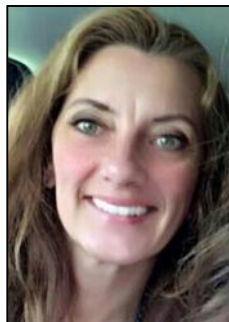
Walk in Closet