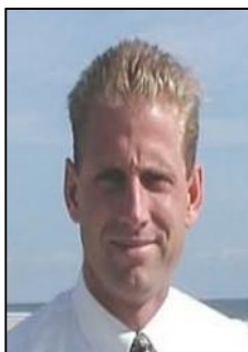
Walk in Closet