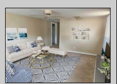
647 1st Somers Point, NJ 08244