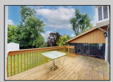
111 Dawes Somers Point, NJ 08244