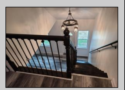
714 8th Ave Galloway Township, NJ 08205