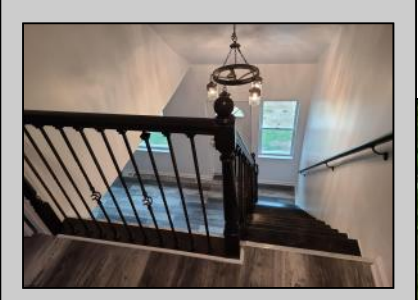
714 8th Ave Galloway Township, NJ 08205