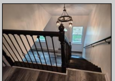
714 8th Ave Galloway Township, NJ 08205