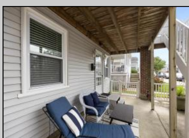
607 Ocean Ocean City, NJ 08226