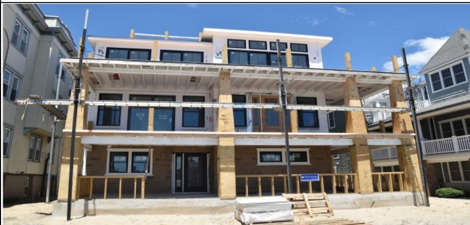
1116 OCEAN AVENUE