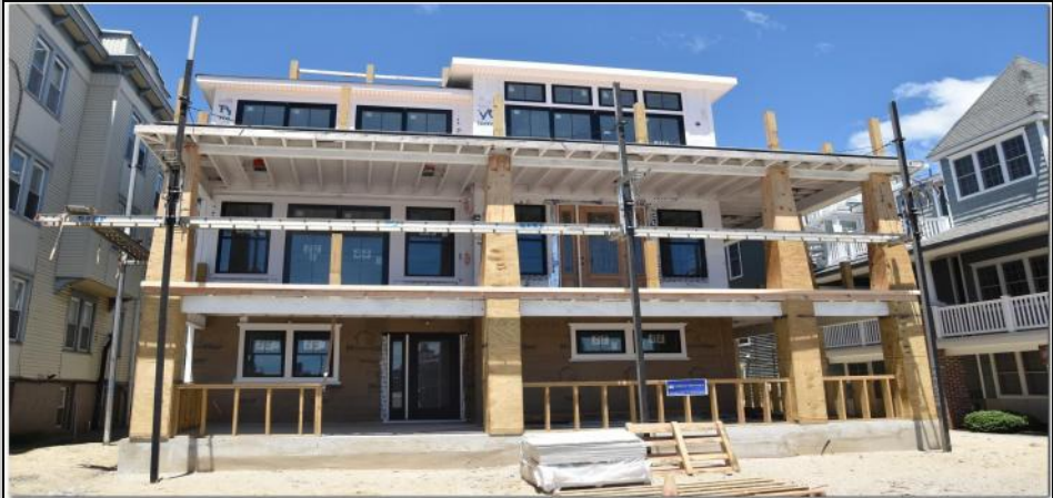
1116 OCEAN AVENUE