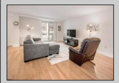
101 Plaza Place Atlantic City, NJ 08401