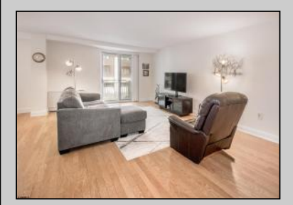
101 Plaza Place Atlantic City, NJ 08401