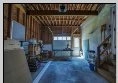
311 Folsom Ave Egg Harbor Township, NJ 08234