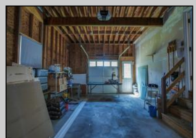
311 Folsom Ave Egg Harbor Township, NJ 08234