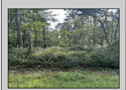
5827 Holly Mays Landing, NJ 08330