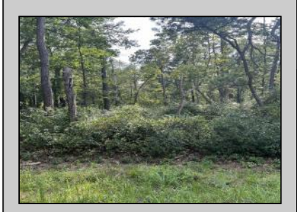
5827 Holly Mays Landing, NJ 08330