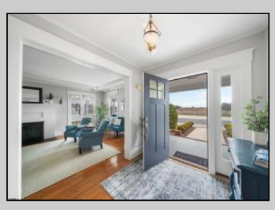
100 Beach Ocean City, NJ 08226