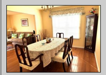
17 Brielle Ave Egg Harbor Township, NJ 08234